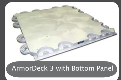
ArmorDeck 3 with Bottom Panel