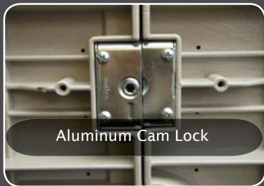
Aluminum Cam Lock