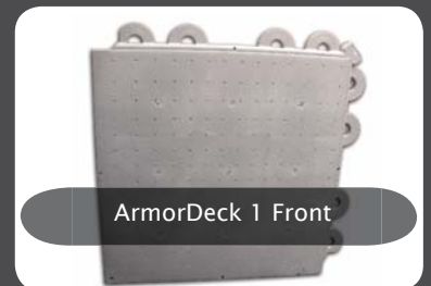
ArmorDeck 1 Front

ArmorDeck 3 (AD3) incorporates a bottom panel that adds strength and stability, nearly doubling the heavy-duty weight loading capabilities of AD1 and AD2. Staging, speaker towers, and lighting trusses and ballast may be placed on ArmorDeck and the system will provide heavy duty protection. When you remove your ArmorDeck floor, your grass may actually look better than it did before you installed the flooring. Simply brush your grass after floor removal and unlike other floors, it will be nearly impossible to see any distinguishable pattern resulting from the floor installation.