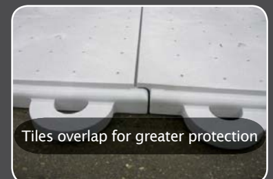
Tiles overlap for greater protection