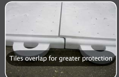
Tiles overlap for greater protection